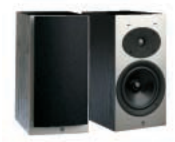
AS-B2 Bookshelf Speakers